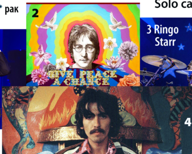
2 John Lennon