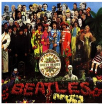
Sgt. Pepper's Lonely Hearts Club Band