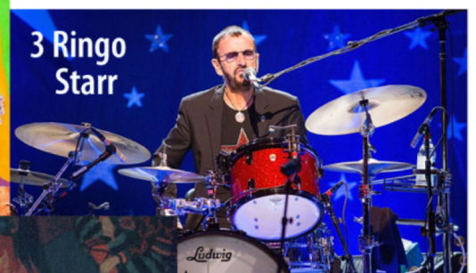
3 Ringo Starr