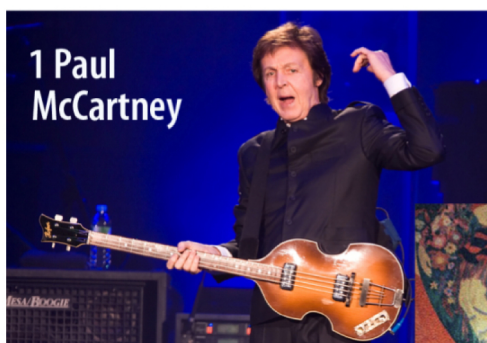
1 Paul McCartney